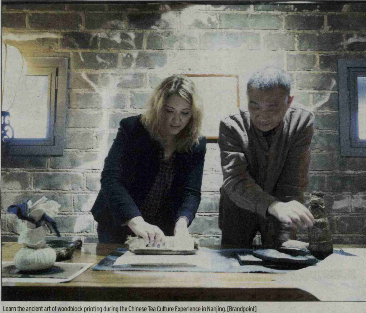
Learn the ancient art of woodblock printing during the Chinese Tea Culture Experience in Nanjing.

Ready to start planning your Nanjing experience? Visit gotonanjing.com for more information, details on tour packages, and other travel planning resources.